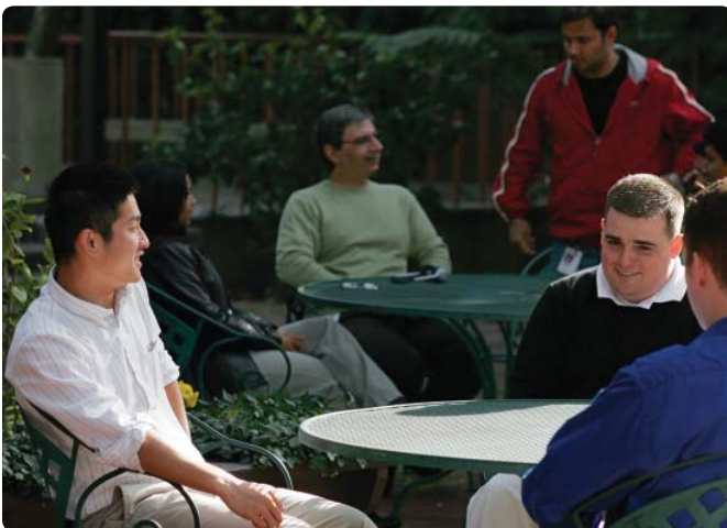
Agilent employees in an informal meeting at the Santa Rosa site