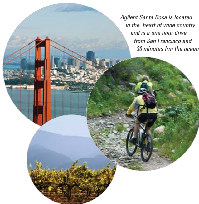
Agilent Santa Rosa is located in the heart of wine country and is a one hour drive from San Francisco and 30 minutes from the ocean

Information in this document subject to change without notice. © Agilent Technologies, Inc. 2007. Printed in USA, February 28, 2007 5989-6310EN